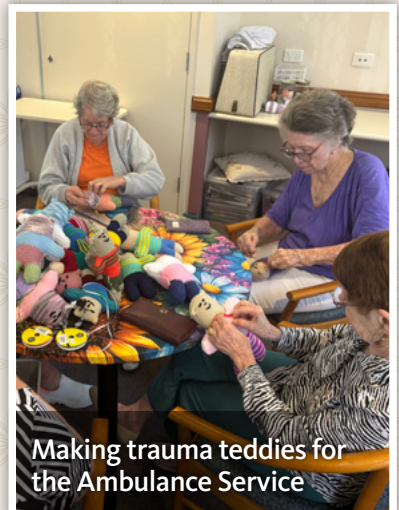
Making trauma teddies for the Ambulance Service