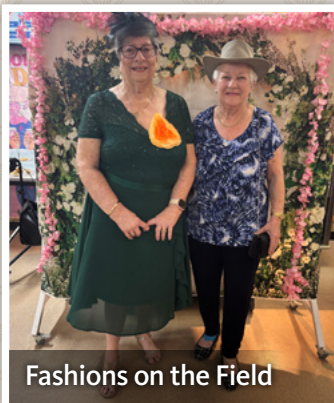
Fashions on the Field