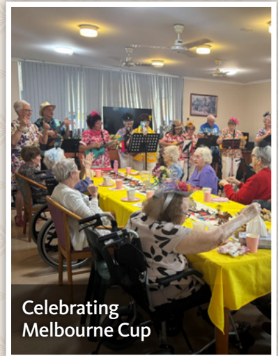
Celebrating Melbourne Cup