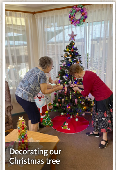
Decorating our Christmas tree