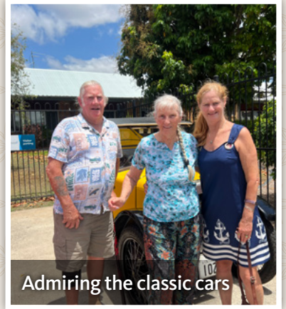
Admiring the classic cars