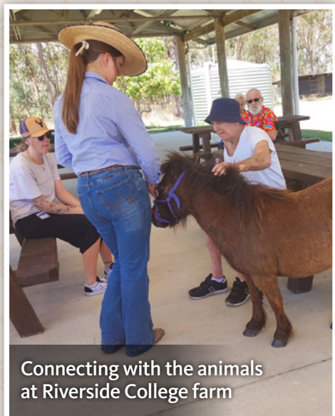
Connecting with the animals at Riverside College farm