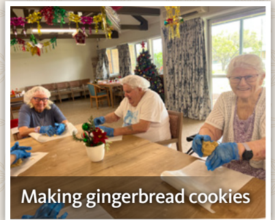
Making gingerbread cookies