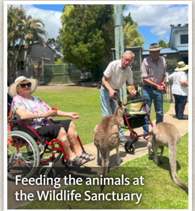
Feeding the animals at the Wildlife Sanctuary