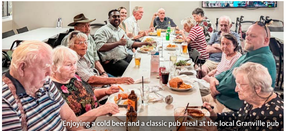
Enjoying a cold beer and a classic pub meal at the local Granville pub

We're excited to welcome students from Riverside Christian College, embarking on studies in Individual Support. Our intergenerational program continues this year where residents and younger students exchange knowledge, wisdom and life perspectives. We've also introduced structured reminiscing sessions where participants share their stories, preserve memories and build shared experiences together.