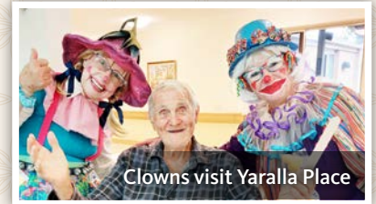
Clowns visit Yaralla Place