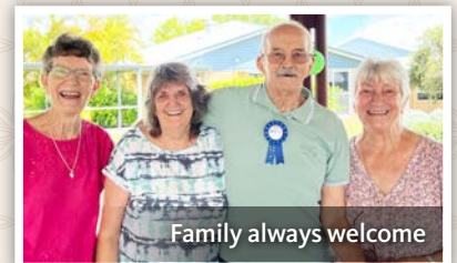
Family always welcome