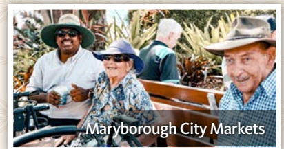
Maryborough City Markets