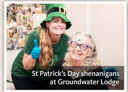
St Patrick's Day shenanigans at Groundwater Lodge