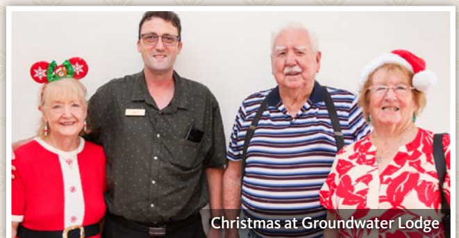
Christmas at Groundwater Lodge