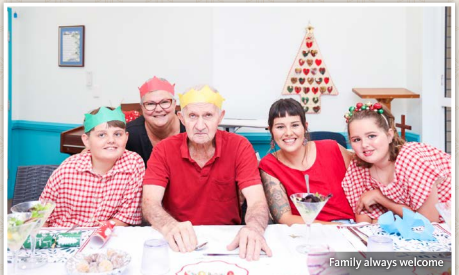
Family always welcome