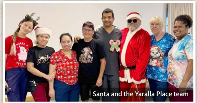
Santa and the Yaralla Place team