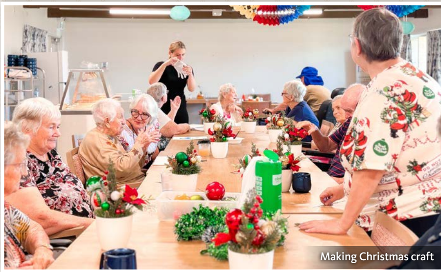
Making Christmas craft