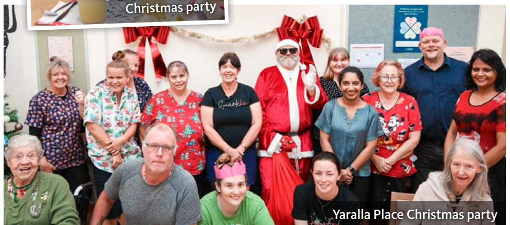
Yaralla Place Christmas party

Santa delivered gifts to every resident, bringing much joy and Christmas cheer.