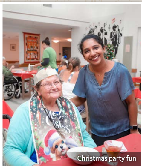
Christmas party fun