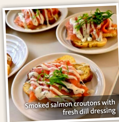
Smoked salmon croutons with fresh dill dressing