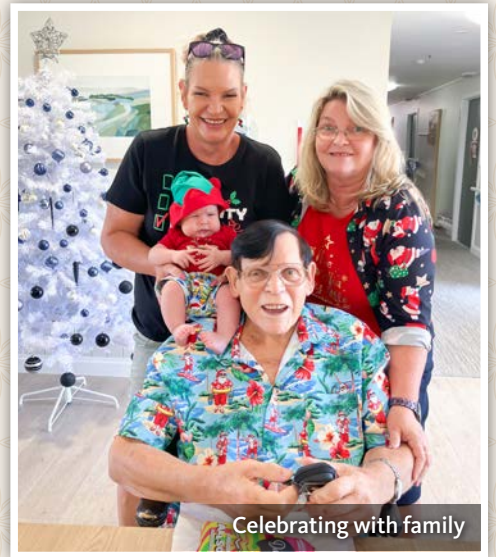
Celebrating with family