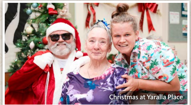
Christmas at Yaralla Place