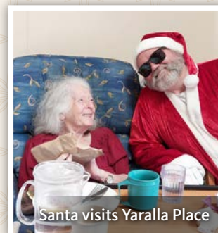
Santa visits Yaralla Place