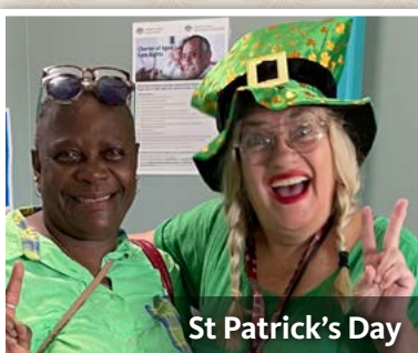
St Patrick's Day