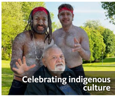
Celebrating indigenous culture