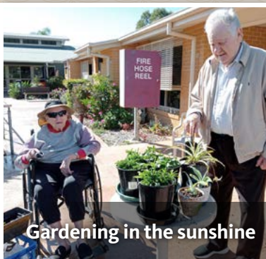
Gardening in the sunshine