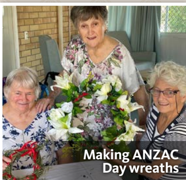
Making ANZAC Day wreaths