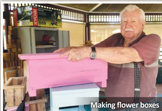
Making flower boxes