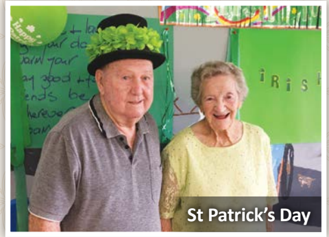
St Patrick's Day