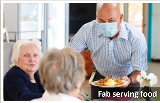
Fab serving food