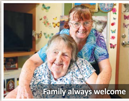
Family always welcome