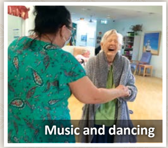
Music and dancing